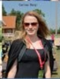
Small text caption for the fourth photo in the row.