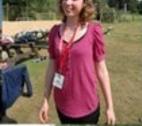
Small text caption for the tenth photo in the row.