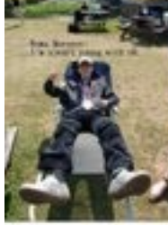
Small text caption for the eighth photo in the row.