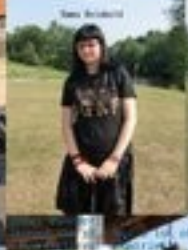
Small text caption for the twelfth photo in the row.