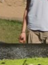
Small text caption for the seventh photo in the row.