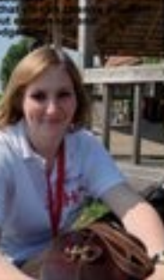
Small text caption for the twenty-third photo in the row.