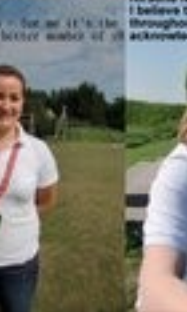
Small text caption for the twenty-second photo in the row.