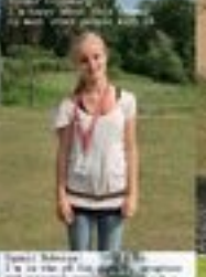
Small text caption for the sixth photo in the row.