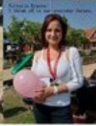
Small text caption for the ninth photo in the row.