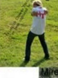
Small text caption for the fourteenth photo in the row.