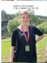
Small text caption for the third photo in the row.