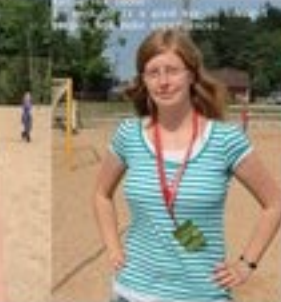
Small text caption for the sixteenth photo in the row.