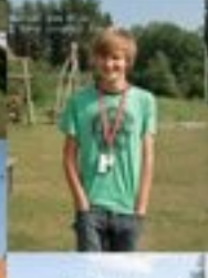
Small text caption for the fifth photo in the row.