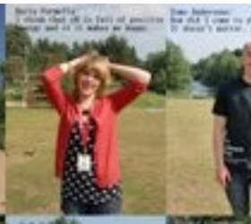
Small text caption for the second photo in the row.