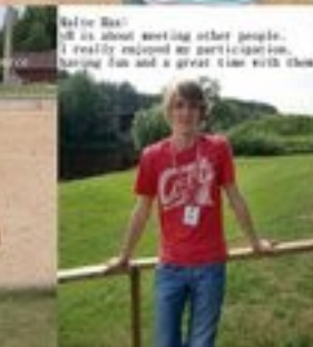
Small text caption for the twenty-first photo in the row.