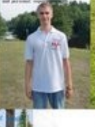
Small text caption for the thirteenth photo in the row.