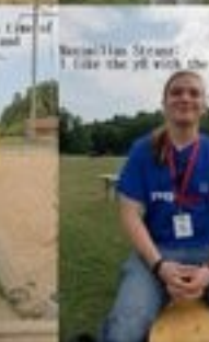
Small text caption for the nineteenth photo in the row.