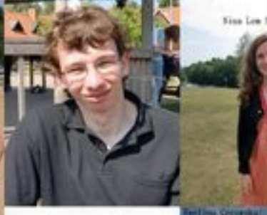
Small text caption for the seventeenth photo in the row.