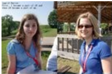
Small text caption for the first photo.