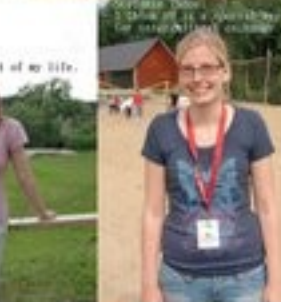
Small text caption for the fifteenth photo in the row.