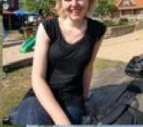
Small text caption for the eleventh photo in the row.