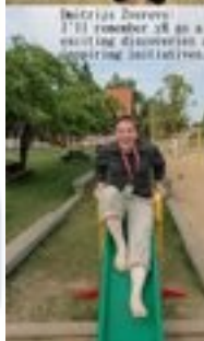
Small text caption for the eighteenth photo in the row.