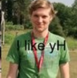
I like yH