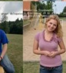
Small text caption for the twentieth photo in the row.